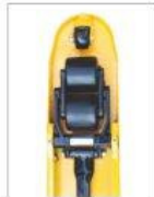
Entry roller for easy operation Innovative wheel frame