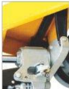
Adjustable pump cap