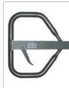
Option: fully rubber wrapped handle