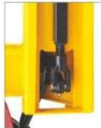
Adjustable straight support