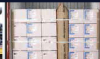
Transport & Logistics