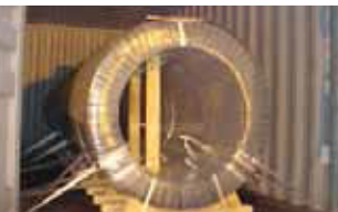
Steel & Metal